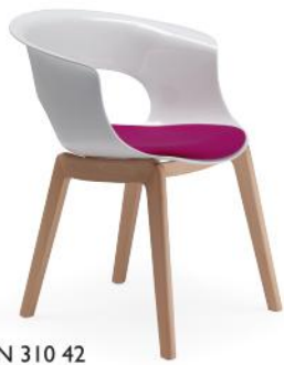
2800 FN 310 42