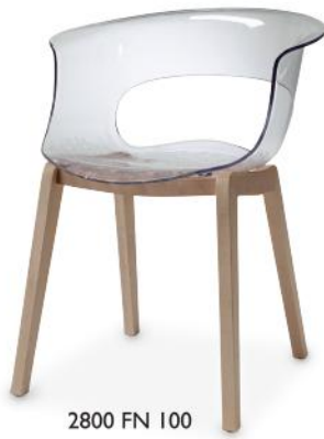
2800 FN 100