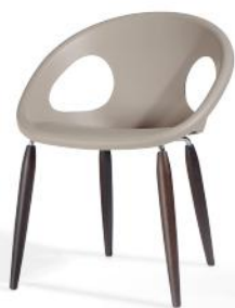
2826 FW 15