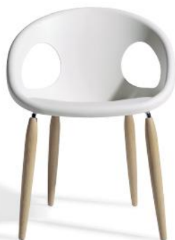
2826 RN 11

Scocca in tecnopolimero riciclabile. Gambe in legno massello. Per uso interno.