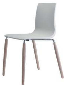
2823 HS 11

Scocca in tecnopolimero riciclabile. Gambe in legno massello. Per uso interno.