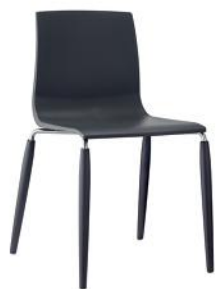
2823 FW 81