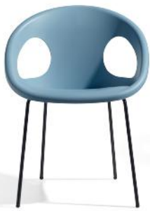
2682 VA 62